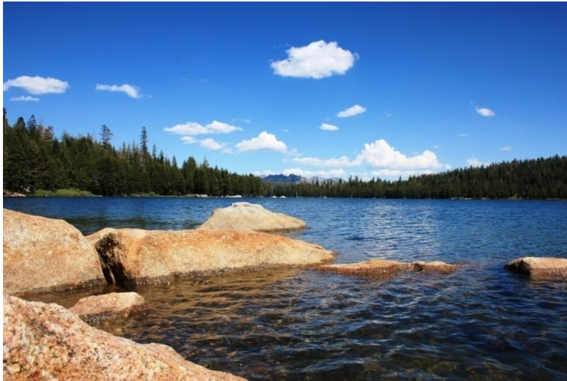
Upper Mokelumne Watershed – Blue Lakes Planning Unit