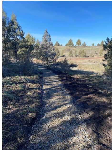
Fall River Lake Trail decomposed granite surface, 2022

The Settlement Agreement required PG&E to establish the Stewardship Council and provide $100 million toward land conservation and youth engagement; $70 million for the land conservation program and $30 million for a program to connect underserved youth to the outdoors. As of August 31, 2022, the Stewardship Council had approximately $13.2 million in remaining assets, which are invested in conservative financial instruments and almost entirely allocated or restricted for specific purposes to implement our work.