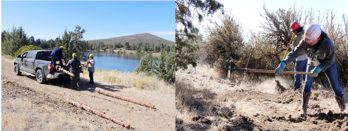
Photo: Pit River Tribal Youth Crew cutting in the Fall River Lake Trail, 2021

In June, our Board and staff toured the newly renovated Sky Mountain Outdoor Education Center, owned and operated by San Joaquin County Office of Education (SJCOE), and were able to see students enjoying the inaugural art camp. SJCOE utilized a $5 million grant to complete necessary facility upgrades including safety and accessibility improvements.