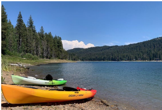
Kayaks at Bucks Lake, Plumas County, by Feather River Land Trust, 2021