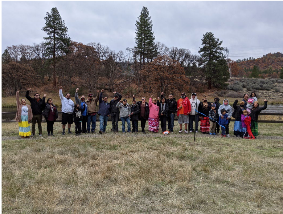
Pit River Tribe celebrates Hat Creek Planning Unit

The other two land donations to the Pit River Tribe included lands at the Fall River Mills and Lake Britton/Hat Creek planning units. These two transactions comprise the remaining 3,554 acres that were transferred to the Pit River Tribe. Shasta Land Trust holds the conservation easements for the Pit River Tribe donated properties.